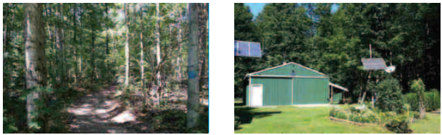
4524 SUMMER • MANCELONA

This is a hunters paradise! Modern living in this completely "off grid" property. No monthly utility bills to pay! Property is operational with solar power and has a generator if/when needed. Modern 4" well(run by generator), 1000 gal. septic, LP for the fridge, hot water, range and wall heater. High efficiency wood stove makes the home very cozy. MLS #449553. $94,900. Ask for Chris Oliver.