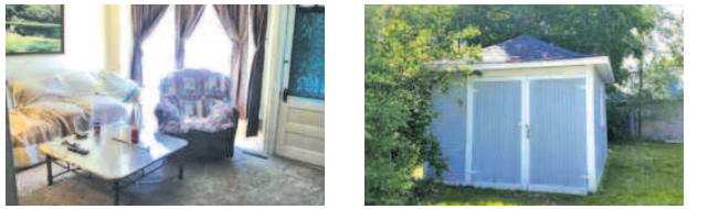
210 THIRD • EAST JORDAN

Charming home in the middle of East Jordan close to schools and just a couple blocks from downtown. Many recent updates including electrical, plumbing, flooring and new paint in most rooms. New roof in 2015 and added insulation where needed. Would make a great rental, or starter home for a new family. Offered mostly furnished! MLS #448631. $69,900. Ask for Chris Oliver.