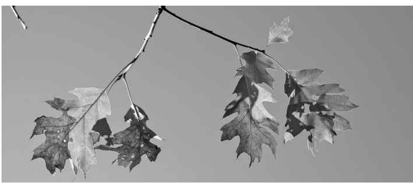
These oak leaves have been affected by oak wilt disease.

"We need to stop that cycle, and that's why it's important for people not to move firewood for the rest of the summer and fall seasons," he said. "With the transport of fire-