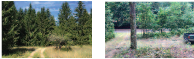
1822 MORRIS ROAD • EAST JORDAN