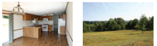
4215 N M-66 HIGHWAY • EAST JORDAN

This home is nestled in 40 acres and is a hunters dream. There is a 3 bedroom 2 bathroom home as well as a barn. Wildlife is surrounding you and can be seen drinking at your pond. New flooring in kitchen and dining area. MLS #445617. $139,900. Ask for Mike Stark or Holly Nierman