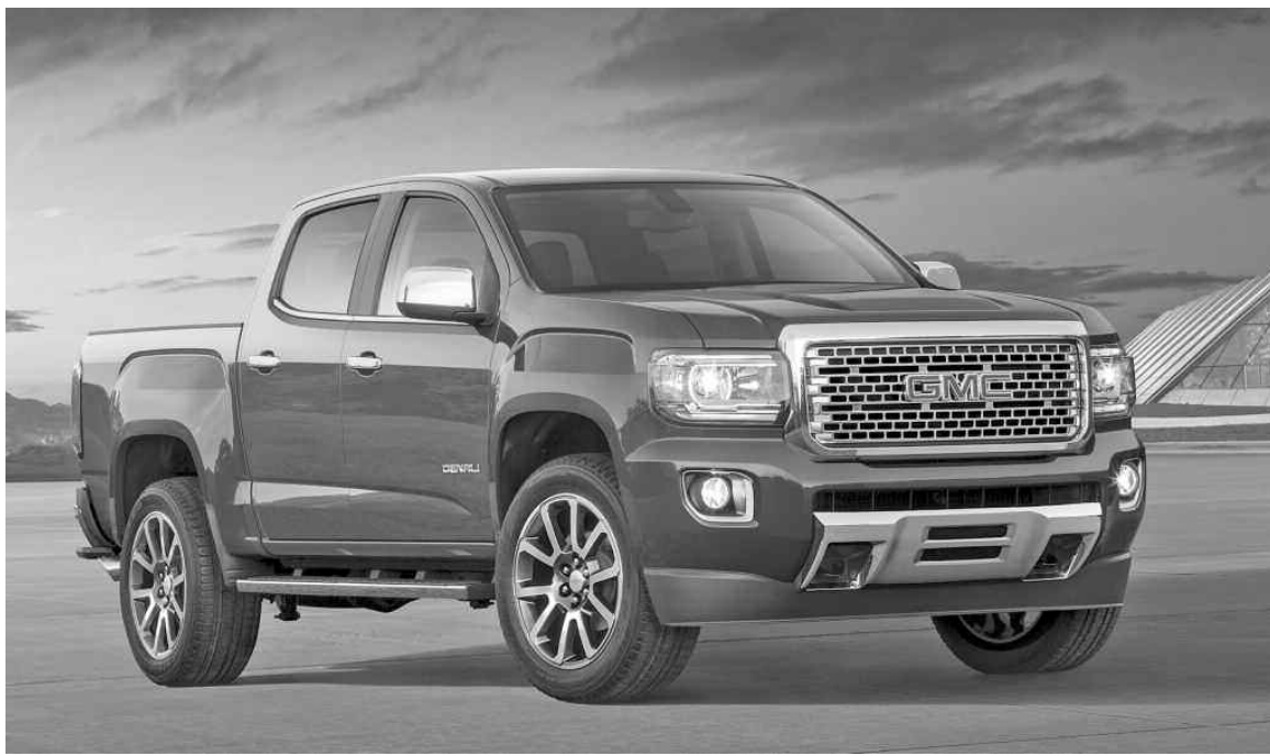
GMC announced a broader 2017 GMC Canyon lineup led by the new, range-topping Canyon Denali and new, off-road-inspired All Terrain X.

The 2017 model year updates, including the new V-6 and eight-speed combination, will arrive at dealerships in the fourth quarter of this year.