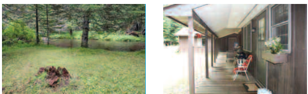
2452 MARTINSON ROAD • EAST JORDAN

Rare opportunity! Almost 200 feet of river frontage on the amazing Jordan River. 4BR 2BA home with newer roof and a 2 car garage ocated on a private road with very little traffic. There is a nice wide path that has been mowed to the rivers edge with a park like atmosphere. MLS #449029. $159,900. Ask for Mike Stark or Holly Nierman