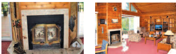
4563 MURRAY LANE • EAST JORDAN

Rare find on Six Mile Lake boasts 3 bedrooms. An amazing deck with beautiful views of not only Six Mile Lake but of Scott's Creek too. Abundant wild life, over 300 feet of lake frontage, creek frontage and all this on over 8 acres of land with a barn. Great open floor plan for entertaining or cozy nights in front of the fireplace. MLS #445956. $199,900. Ask for Mike Stark or Holly Nierman